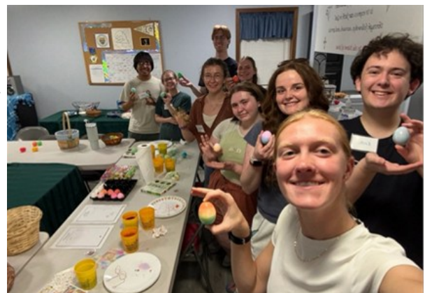
The students had a great time dyeing Easter eggs in early April!

Minister of Word and Service † Chaplain, Lutheran Campus Ministry at UD